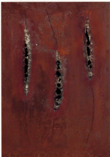
ThreePods. 2011, steel 48x34 in.

Open studio, October 27 through October 29